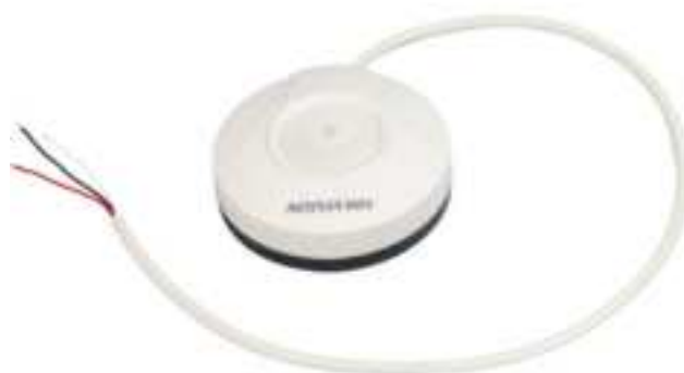
Figure 1: DS-2FP2020 Microphone

Hikvision microphones are line level, and have a built-in preamp, which requires power. There are three wires coming out of the microphone cable (Figure 1):